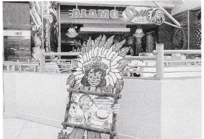
The Spur in the Tyger Valley Centre was robbed on Sunday.

These were just some of the hundreds of comments posted as the story published on the TygerBurger website started circulating on Monday. In the meantime, police have